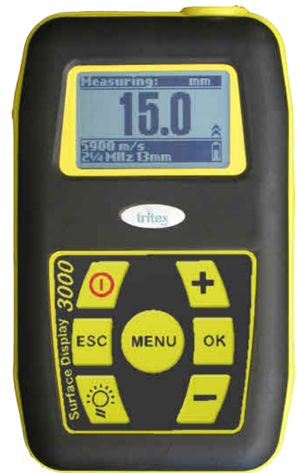
Surface Display Unit

The Multigauge 3000 can be easily upgraded to one of two topside repeater options by simply replacing the end cap. An alternative end cap houses an Impulse connector for connection to an umbilical. The umbilical can be up to 1000 metres long.