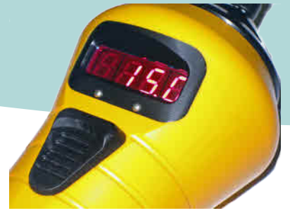
Large Bright 10 mm Display