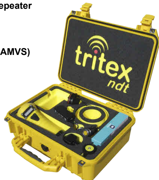
Multigauge 3000 Standard Kit